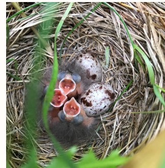
Savannah sparrow nestlings

This nesting strategy helps protect them from their natural predators, but also makes them extremely vulnerable to destruction by mowing operations during this critical period.