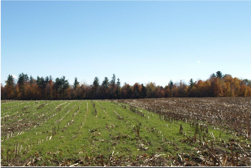
Pictured above is a winter cover crop trial on a corn field in Saint Albans.

info@somersetswcd.org www.somersetswcd.org